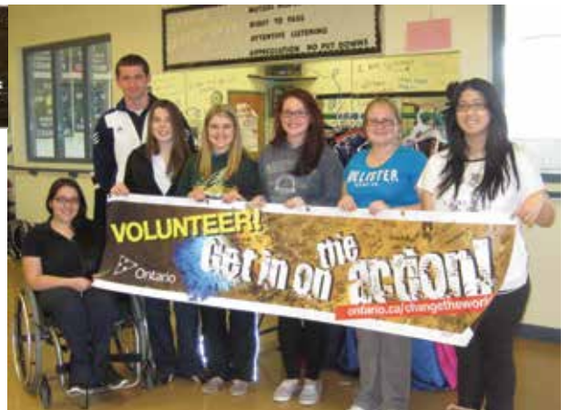
Youth at UCC volunteer at a Prom Dress Sale

In Chatham-Kent our 2013 goal was to engage 419 youth in three hours of service between April 21 to May 20, 2013. This year, locally, we engaged 427 youth, up from last year's total of 350. The youth participated in many activities around the municipality including events such as a Prom Dress drive, coaching soccer, and planting trees. Although only three hours per volunteer are required by the campaign, the hours for Chatham-Kent exceeded this, totaling nearly 2,200 hours.