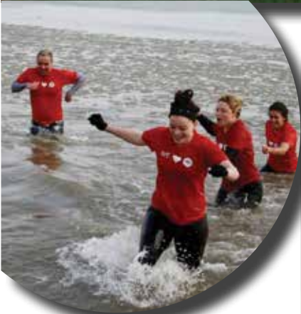
Freezin' for a Reason Ridgetown