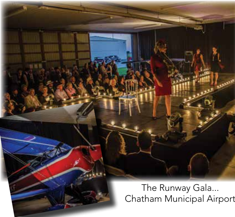
The Runway Gala... Chatham Municipal Airport