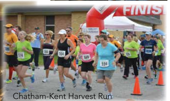
Chatham-Kent Harvest Run