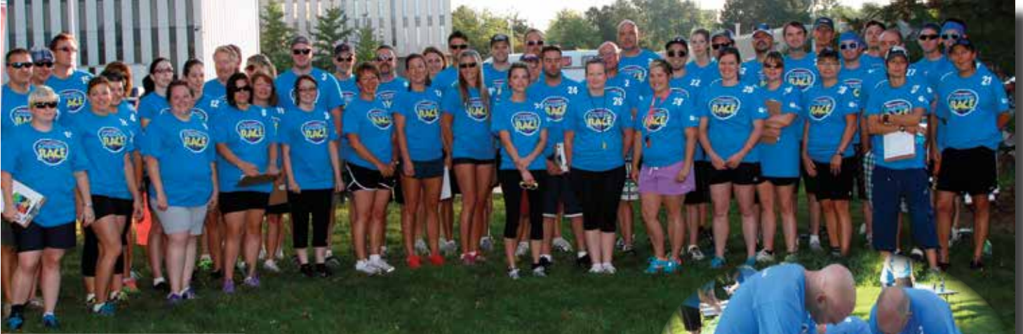
Chatham-Kent Amazing Race