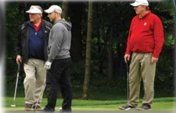
Above: Bothwell Golf Tournament Right: Bothwell Biker's & Babe's Kickoff